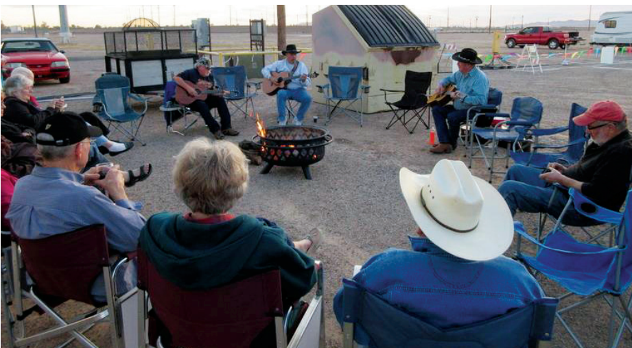
Saguaro Jetsetters at Bluegrass Rally