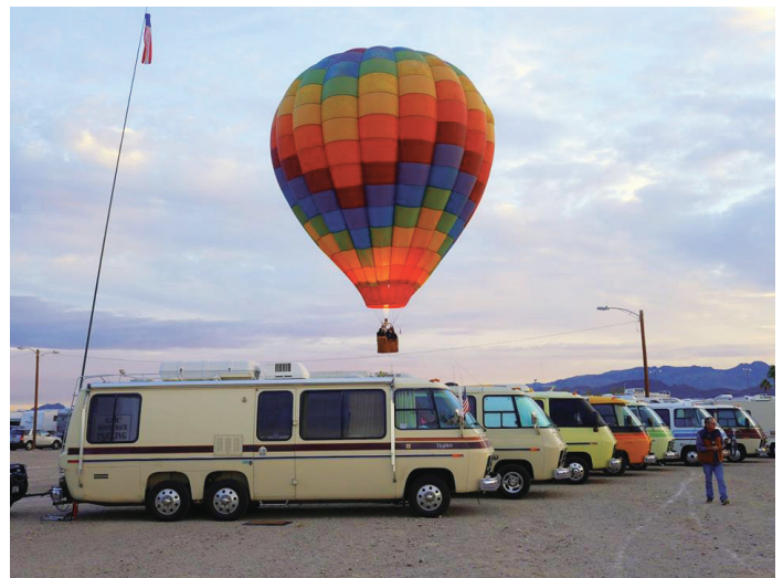
Lake Havasu Balloon Rally 49ers and Pacific Cruisers