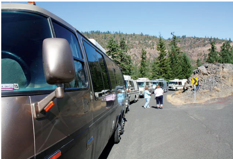
Cascaders Rolling Rally