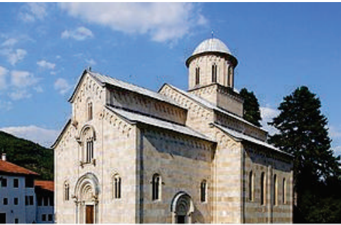
Serbian Orthodox Monastery of Decani, built in the 14th century

The identity of Serbs is rooted in Eastern Orthodoxy. Three elements were crucial in forging and preserving Serbian identity during almost five hundred years of the Turkish rule in the area: the Serbian Orthodox Church, the Serbian language, and Kosovo Myth.