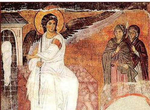
The White Angel fresco from Mileševa Monastery

The tradition of slava, the family saint feast day, is an important ethnic marker of Serb identity, and is usually regarded their most significant and most solemn feast day. Serbs are the only Christians who celebrate “slava” – a patron saint day. It is the tradition of the ritual celebration and veneration of a family’s own patron saint.